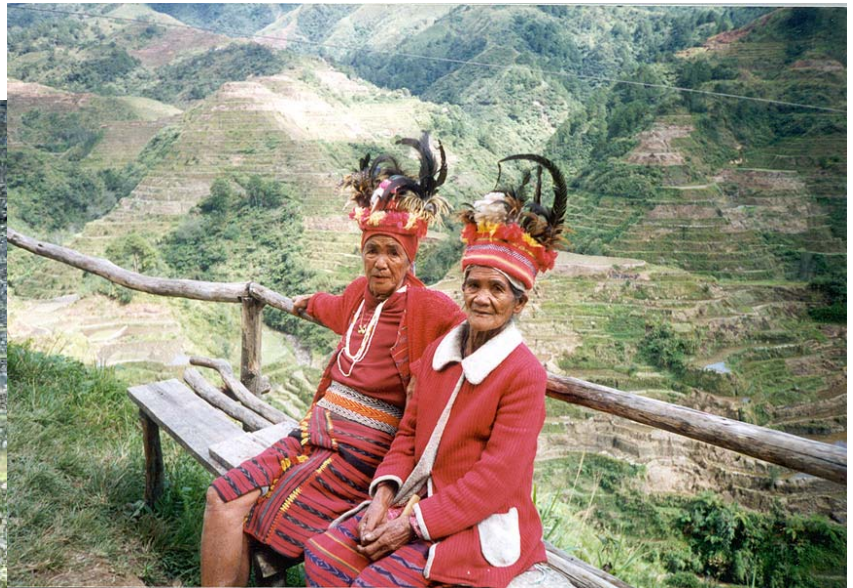
Banue, the Philippines